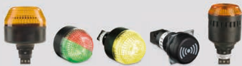
Signalers for built-in mounting Built-in elements for M22 P series