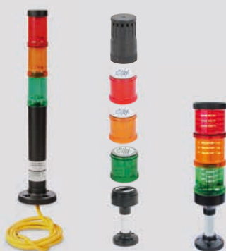
Signaling columns Ready-made C3 / modular E4 and E7

Our wide product range of signaling columns and signalers with or without sound module covers all requirements.