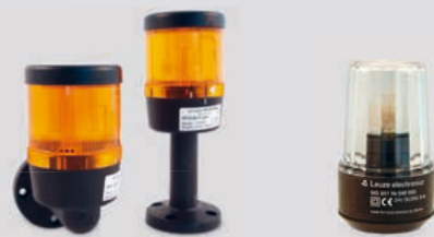
Signaling of the muting state MS muting lamps