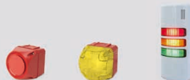
Signalers for wall mounting EMS and FBA / D9 wall lamp