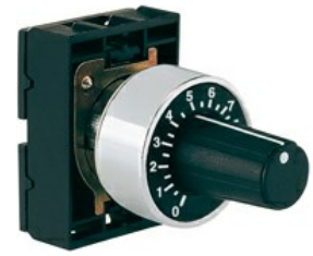
Potentiometer drives complete with mounting adapter - With graduate scale 8LM2TP100