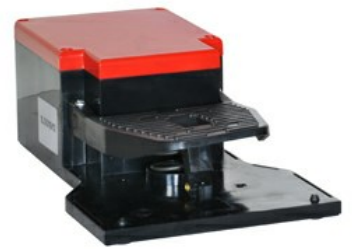
One pedal, with pedal actuator lock - open KG120