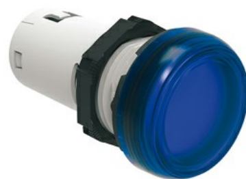
LED integrated monoblock pilot lights steady light LPML