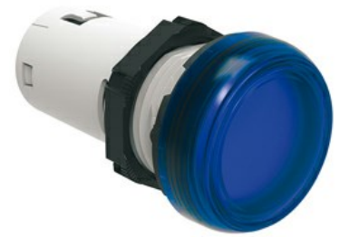
LED integrated monoblock pilot lights steady light LPML