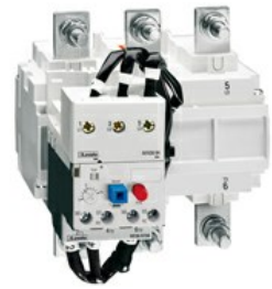
RFN200 Motor protection relay