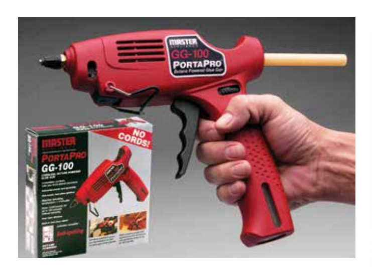
GG Series PortaPro Glue Gun GG-100

Includes: glue gun, general purpose tip (35408) and four general purpose 6" glue sticks