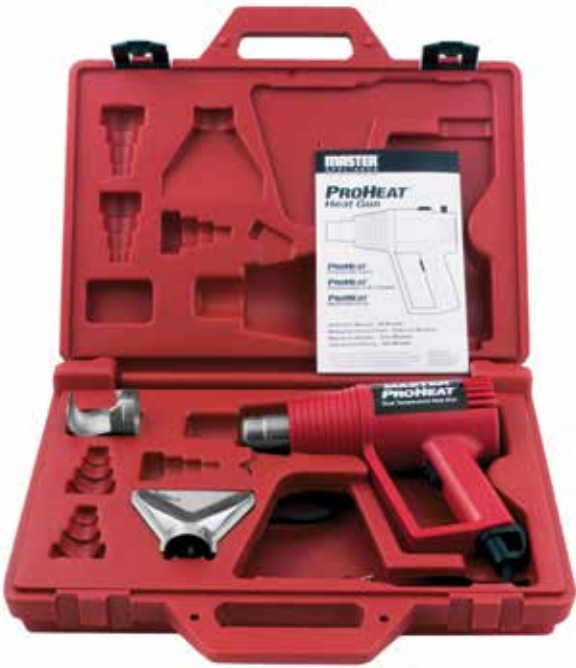
PH-1100K Proheat Dual Temperature Heat Gun with rugged storage case and 2 attachments (35016 & 35017)