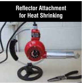
Reflector Attachment for Heat Shrinking