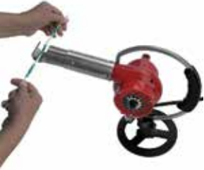
Deluxe stand gives more hands-free choices