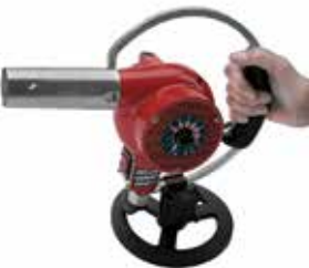
Ergonomic handle with spring loaded slide grip