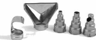
Quality attachments for professional applications