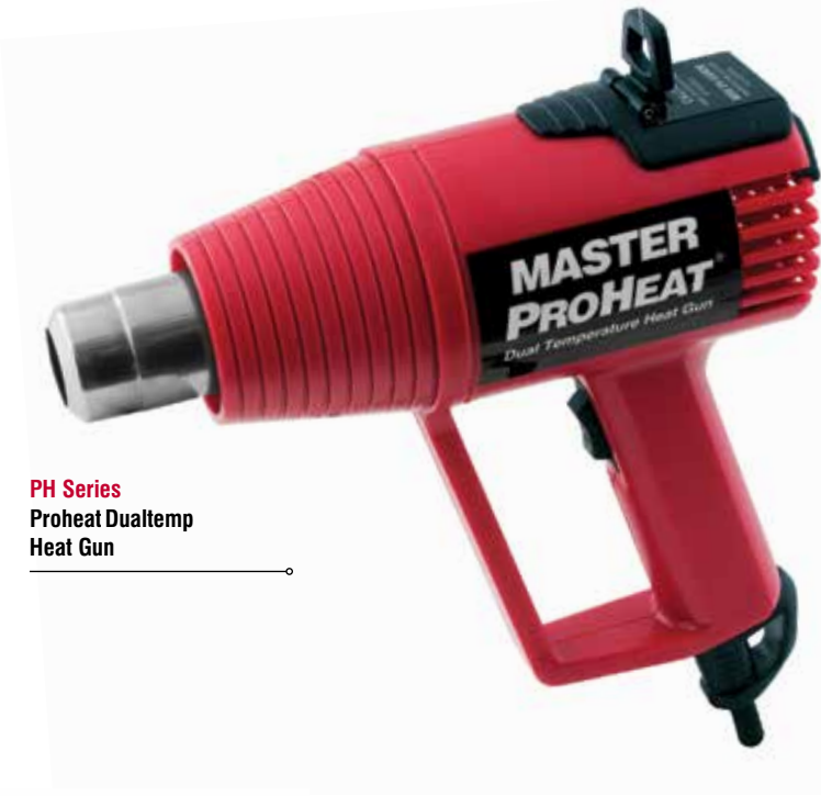
PH Series Proheat Dualtemp Heat Gun