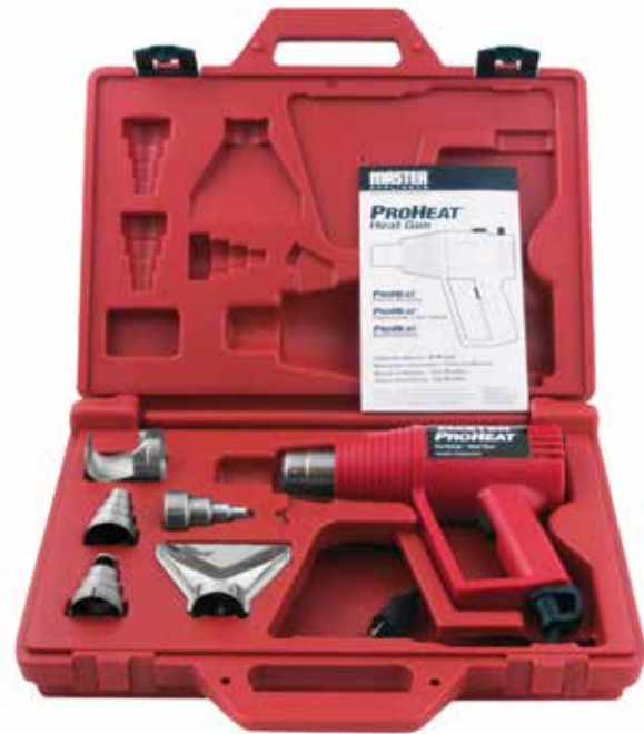
PH-1200K Proheat Varitemp Heat Gun with rugged storage case and 5 specialty attachments