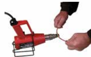
PH-1200-1 Bench-Top Heat Shrink System