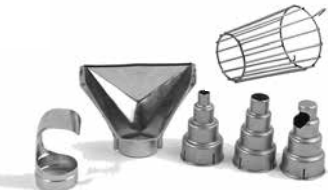
Quality attachments for professional applications