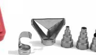
Quality attachments for professional applications