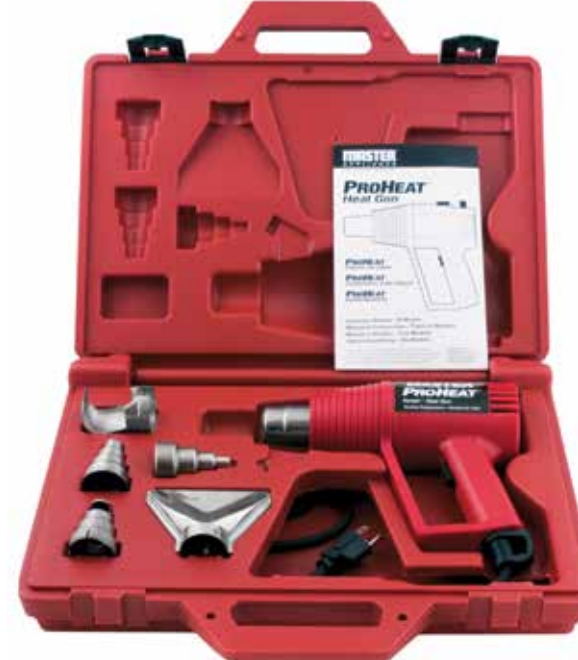
PH-1300K Proheat Variair Heat Gun with rugged storage case and 5 specialty attachments