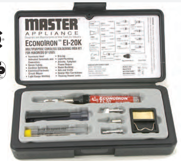
See above for more EI-20 accessories

Refill with Master Ultratane Butane for best performance. (page 28)