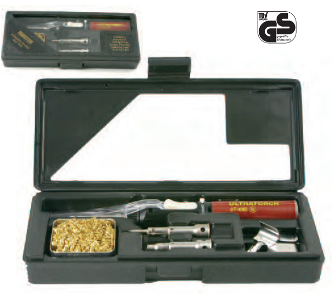
See above for more UT-40SiK accessories. Refill with Master Ultratane Butane for best performance. (page 28)