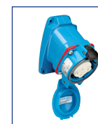
Female Receptacle with Angle Adapter 07-A4001 + 01-NA027