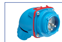
Male Inlet with Handle (Plug) 07-A8001 + 01-NA313

A typical order should include an inlet part number, a receptacle part number AND the matching handles, angles or other required accessories.