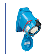
Female Receptacle with Angle Adapter 09-P4061 + 01-NA027