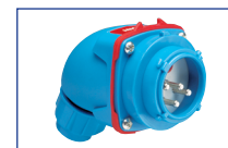
Male Inlet with Handle (Plug) 09-P8061 + 01-NA313

A typical order should include an inlet part number, a receptacle part number AND the matching handles, angles or other required accessories.