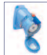
Female Receptacle with Angle Adapter 63-14043 + 61-1A027