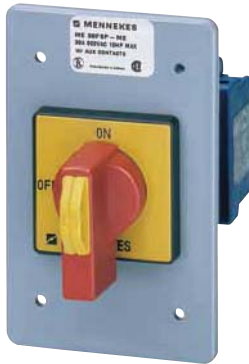
Shown with Weatherproof FS Plate.