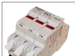
WMB Marker System