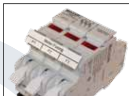
Continuous marking strip and adaptors

* USCMA required for use with USCM0 and USCM1