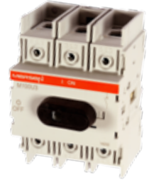
M100U3 - M125E3