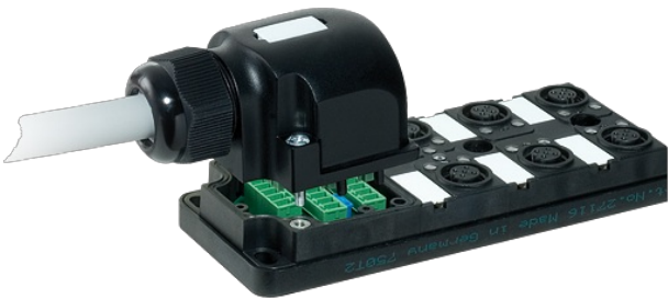
M12 Females 4-pole

6-way, 4-pole PUR/PVC 3.0 m with LED for digital PNP-signals 24 V DC Further cable lengths on request. Plastic housings with good resistance against chemicals and oils.