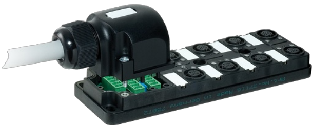
M12 Females 5-pole

Further cable lengths on request. Plastic housings with good resistance against chemicals and oils. The resistance to aggressive media should be individually tested for your application. Further details on request. 8-way, 5-pole PUR/PVC 5.0 m with LED for digital PNP-signals 24 V DC