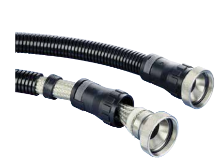
VIMV - Connector straight, female UN thread for MIL-C5015