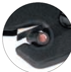
Cutter on bottom means less hand force required