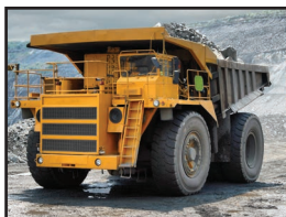
Specialty Trucks, such as Dump Trucks, Garbage Trucks, Concrete Trucks, Utility Trucks