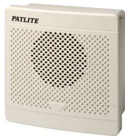
-J (Light gray)