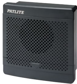
-K (Dark gray)

The BKV Series features programmable voice signaling, an embedded mounting design, and a sound output of 95dB.