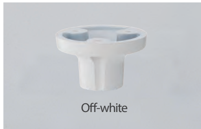
• Pole Bracket (Off-white) B22210134-7F1