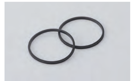
• Waterproof Ring 'B' B25110042-F1