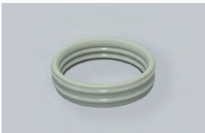
• Waterproof O-ring B25110047-F1