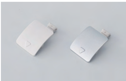
• USB Port Cover (Off-white) B22100071-7F1 (Silver) B22100071-9F1