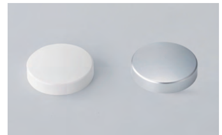
• Headcover (Off-white) B31310001-7F1 (Silver) B31310001-9F1