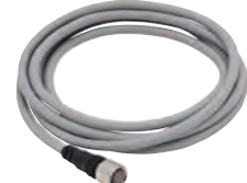
M12 Connector & Cable Manufactured by the OMRON Corp.) SZ-120-02 Cable Length 2 m (XS2F-D821-DH0-R) SZ-120-05 Cable Length 5 m (XS2F-D821-GH0-R) SZ-120-10 Cable Length 10m (XS2F-D821-JH0-R) *Only for connecting to the LS7.