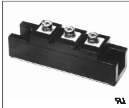
CDD10810 Dual Diode POW-R-BLOK™ Modules 100 Amperes/800 Volts