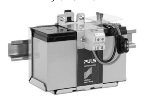
Fig. 26-1 UZK12.071