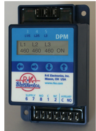
DPM with tabs (cover shows DPM with blocks)