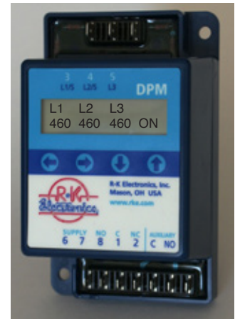
DPM with tabs (cover shows DPM with blocks)

"Bad Freq" Line frequency out of allowable range of 45 to 65Hz)