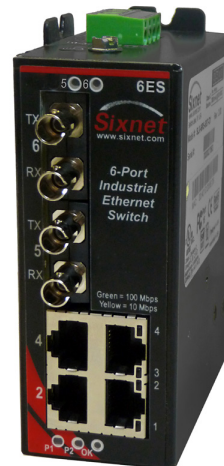
SLX-6ES-4/5 Aluminum Case Wide Temperature

We have been designing industrial hardware such as Remote Terminal Units for over 30+ years and have used this expertise to design the toughest Ethernet switches on the market. Don't trust your critical communications to so-called industrial hardware from commercial switch manufacturers. Sixnet switches give you proven assurance that your system will keep running for years to come.