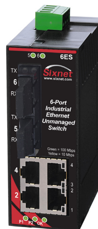
SL-6ES-4/5 Lexan Case Standard Temperature