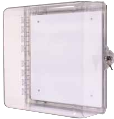
STI-7530 with Key Lock