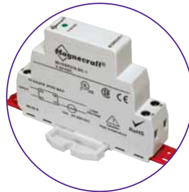
Optional Panel Adapter (16-788C1) See Section 3 p.18

We at Magnecraft are excited at the breadth of products and solutions we are able to offer engineers and designers. And this is just the beginning. We will continue to develop high value products—with innovative features not offered anywhere else in the industry.