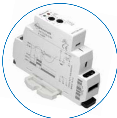
Optional Panel Adapter (16-788C1)