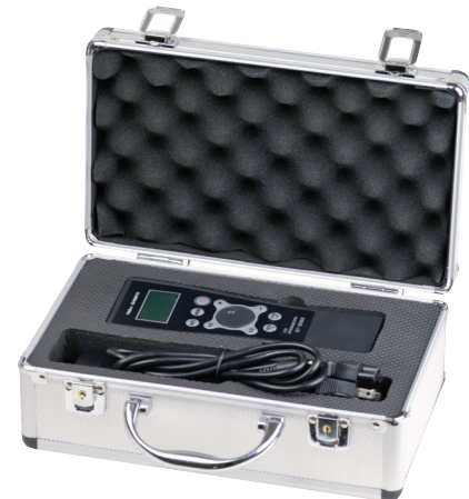
DT-326B in Included Protective Carry Case.