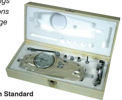
MF in Standard Carrying Case