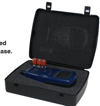
PT-110 with included protective carrying case.