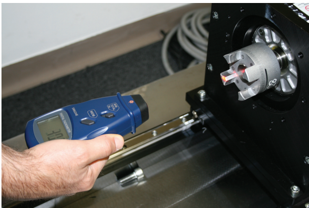
PT-110 recording rotational speed of machinery.