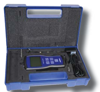
FG-7000 with Accessories in Protective Carrying Case