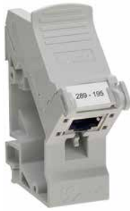
Interface Module; RJ-45; IDC; Cat. 6; with mounting carrier; with shield connection