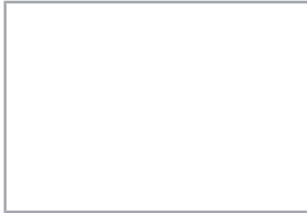
Quick and easy mounting!