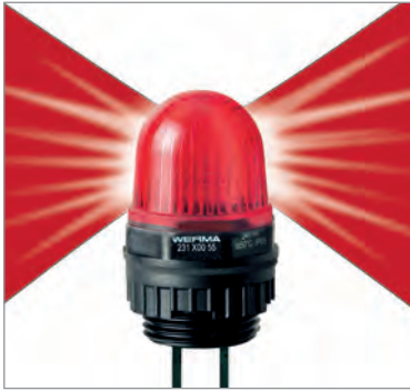
Mainly sideways illumination