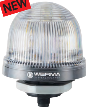
816 Multicolour with clear lens