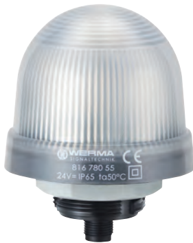
816 Multicolour with opaque lens