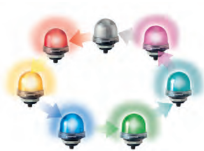
7 colours in one beacon: red, yellow, green, white, blue, violet and turquoise