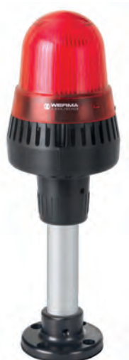
The adaptor (accessory) allows quick and simple mounting on a tube