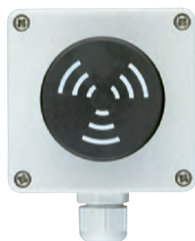
Surface housing (accessory)