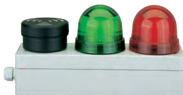
Surface housing (triple) for 2 beacons and 1 audible element (not included in assembly)