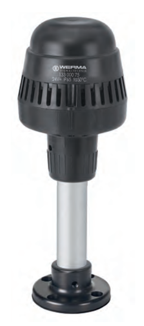
The adaptor (accessory) allows quick and simple mounting on a tube

Tone frequency: 2.3 kHz Life duration: > 5,000 hrs 100 % Duty cycle: