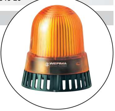
Buzzer in combination with Xenon Flash or LED Permanent Light see 194 and 192