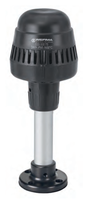
The adaptor (accessory) allows quick and simple mounting on a tube