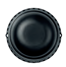
Top view: Mounting holes integrated into the product rim allow easy mounting without having to remove the cap