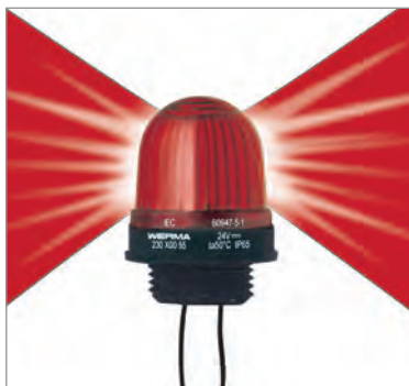
Mainly sideways illumination